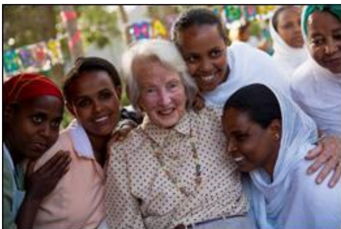
Another 90th Birthday picture! Dr Hamlin with some of her Staff

The girls training to be midwives are sent to hospitals for some of their clinical training. One is a Catholic mission hospital almost a day's journey south from Addis Ababa. Our students stay a few weeks and during this time see many abnormal cases. We are thankful for the cooperation of such a good hospital, where the staff are so helpful and kind to their patients. We are very grateful for this clinical training given so generously, and for the way a labouring woman should be cared for. This equips our students with confidence to tackle abnormalities that they will encounter in their clinics and the decisions they have to make when alone in the bush with a difficult labour. We must not forget them, and we will always support them.